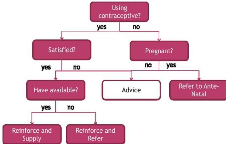
Figure 2: Simplified outline structure of the Family Planning application